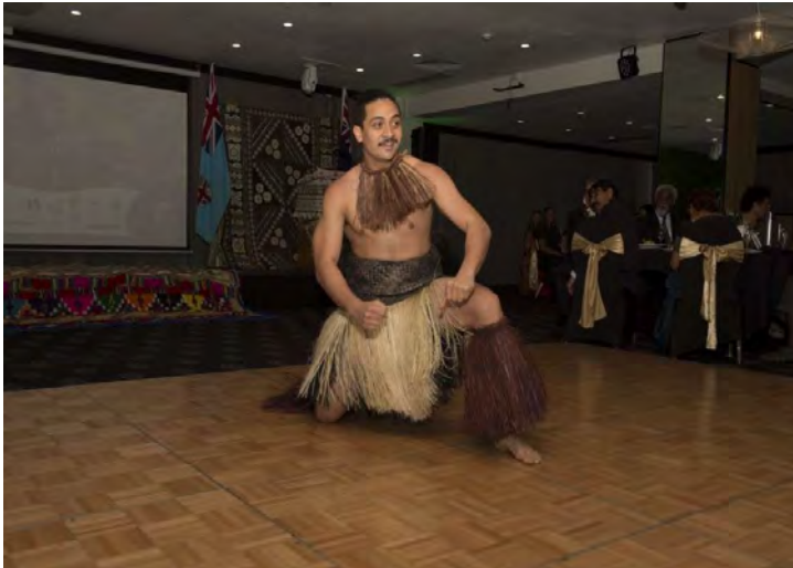
Rotuman Dance performance at inaugural fund-raising dinner for maternal care hospitals in Fiji, 8 October 2021