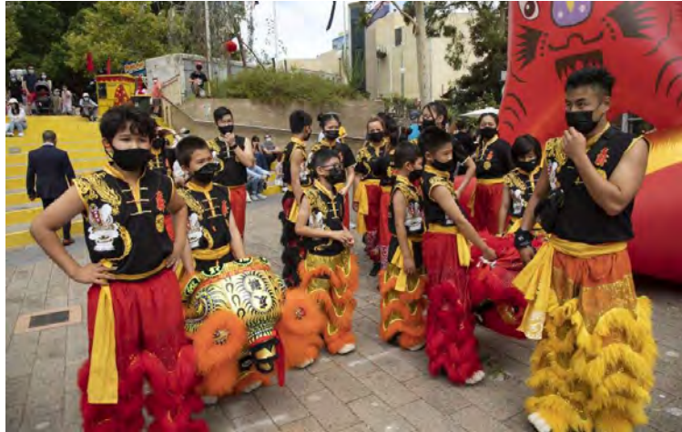
Young lion dancers from the Chung Wah Association of Perth prepare to perform at the Chinese New Year cultural festival, Perth, Western Australia, 2022.