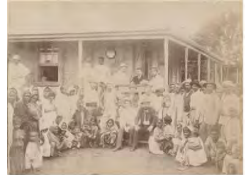
Indian labourers with their families and European overseers gathered in front of a house with verandah, Fiji, 1890 http://nla.gov.au/nla.obj-2869590249